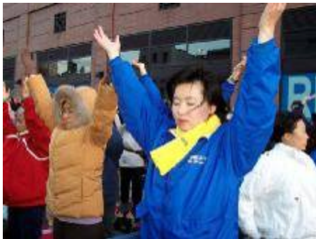
Group Exercise in front of Chinese Consulate in New York

During the rally, several witnesses of the "April 25" Appeal shared their personal experiences during the historic appeal and testified that it was legal, peaceful and rational.