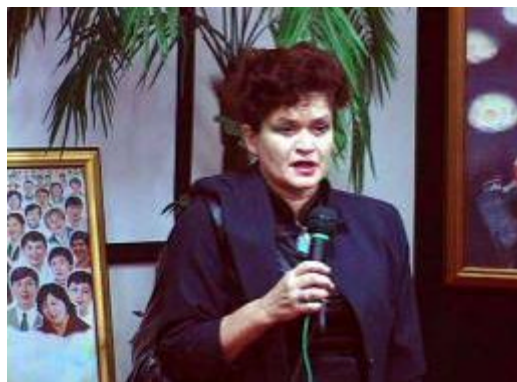
A faculty member at the University of Sydney