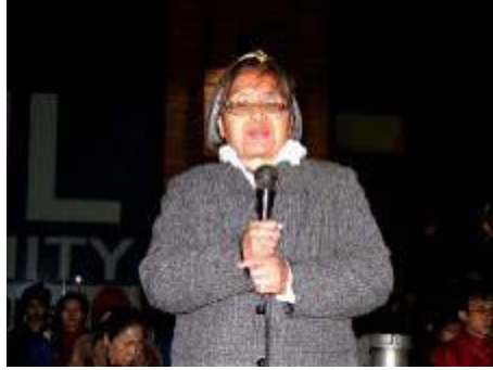
A witness to the "4.25" peaceful appeal talked about its historical significance