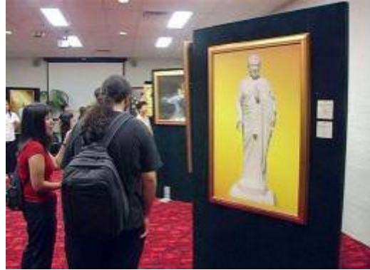
The exhibition site

This exhibition attracted many students, especially Chinese international students. One student said: "In China, the government always lies to us, all media are owned by the CCP, and they have been spreading propaganda to turn public opinion against Falun Gong. We don't know anything about what the government has been doing under the table. We have only learned the truth of the persecution from this exhibition, fliers we received on streets and some local news reports. As we have learned about the truth, we won't just listen to the propaganda any more. I feel that this exhibition is very shocking."