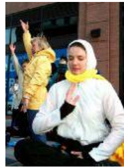
Sending righteous thoughts