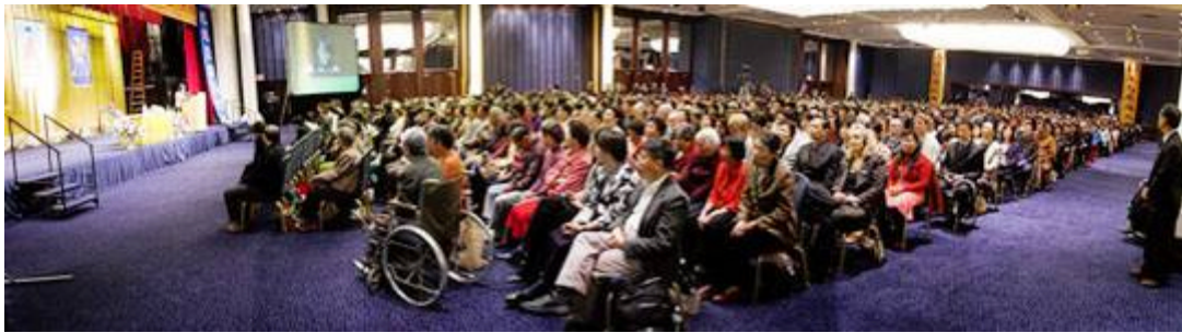
About 4,000 Dafa practitioners from around the world attend the conference

The practitioners' sharing topics included the anti-torture exhibit sites in Manhattan, the lawsuit against Jiang filed in Japan, computer technical support in Taiwan, and the wide spread of Falun Dafa in eastern Africa.