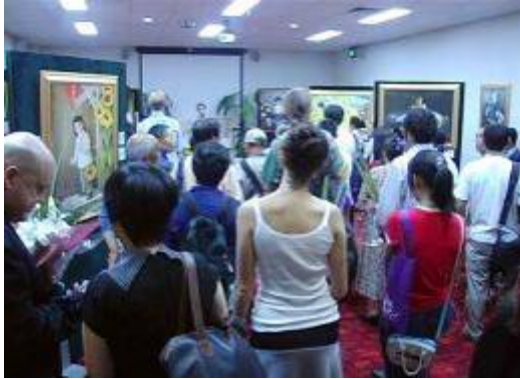
The exhibition site